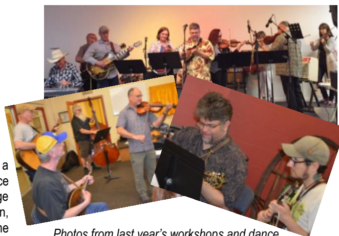
Photos from last year's workshops and dance.

Instructors, scholarship recipients and NWWSMS musicians will be playing a variety of western swing dance music from 1 to 4. Dance instruction will take place from 12:00 to 1:00; and, again, from 2:15 to 3:00. Once again, there is no charge for this event! Food and drinks are available at the club. Come by to dance, listen, meet our talented instructors and encourage the scholarship recipients to become more active in the NWWSMS!