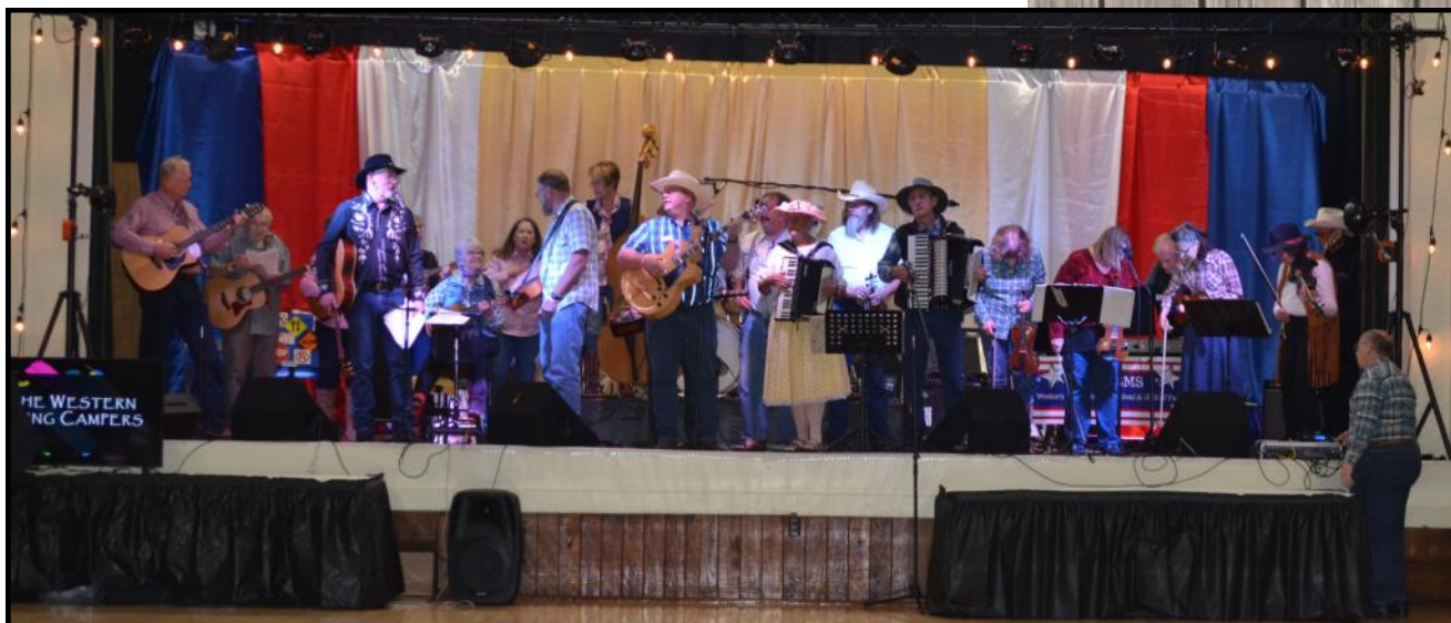
Opening Day 2 of the festival on Saturday afternoon were the 'Western Swing Campers.' With a little encouragement from their instructors, they took the stage and after a brief sound check began playing. They were incredible! In no time, the dancers were filling the floor! (Someone counted 20 musicians on stage - setting a new record and challenge for the Sound Man - pictured lower right.)