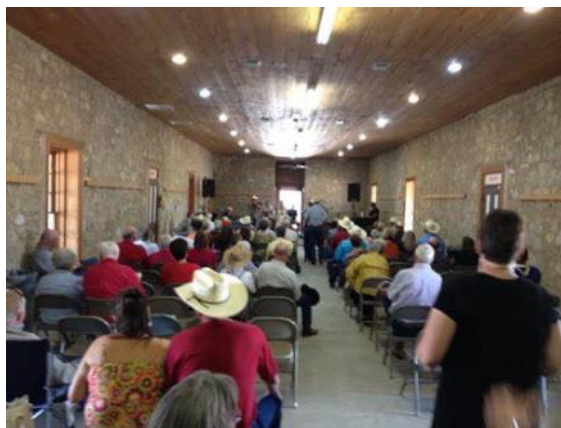
San Angelo Cowboy Gathering - THEN In the beginning at Fort Concho

Sponsorships will go on sale in January 2017, and General Admission in early May 2017 and they will be gone in a hurry.