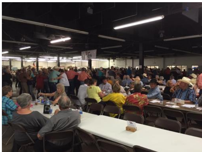
San Angelo Cowboy Gathering - NOW - held in the Wells Fargo Pavilion