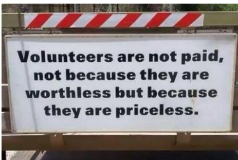
This sign captured my feelings, exactly! JY

While we're on the subject of the host bands who perform at the western swing monthly showcases, don't forget to cast your votes for your favorite