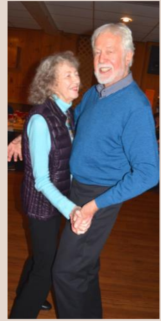
Hope to see everyone at the February Showcase. Save a smile for the camera!