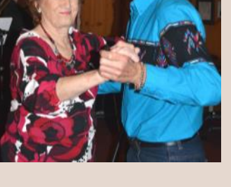
Hope to see everyone at the December Showcase. Save a smile for the camera!