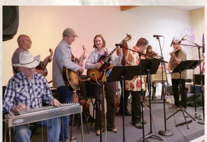
Pictured: Workshop and Band clinic photos from 2016

Application forms and more information available at the NorthWest Western Swing Music Society website: <a href="http://nwwsms.com">http://nwwsms.com</a>