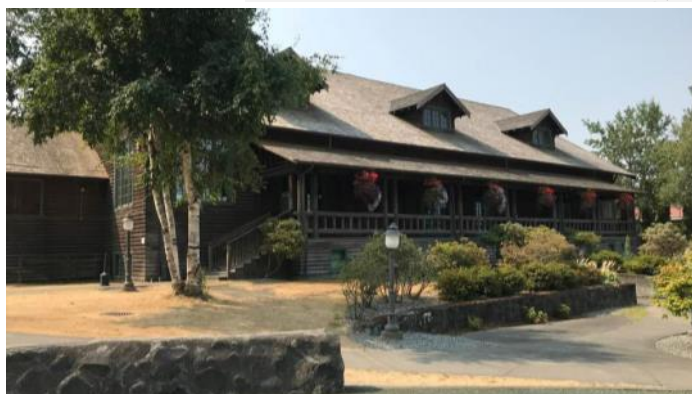
Pictured left: Above: Warming up inside the hall, Front Porch Jam Below: A front Porch Jam Session