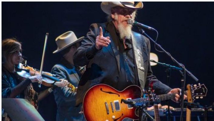
Ray Benson of Asleep at the Wheel opens for George Strait at Dickies Arena in Fort Worth, Texas on November 23, 2019.

Or as he put it, 'I kicked that son of a gun. I'm back in the saddle again.'