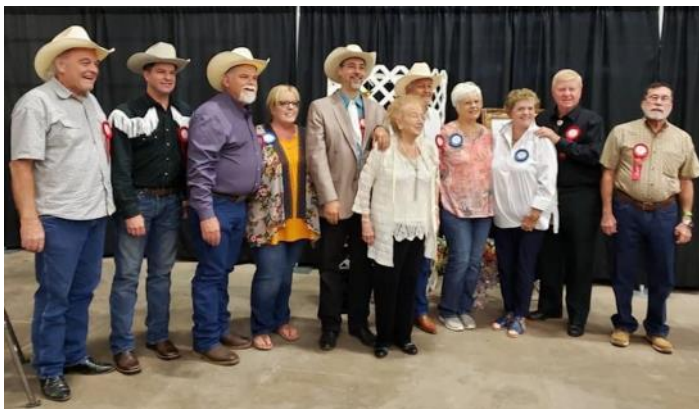
WSMSS 2021 Hall of Fame Inductees

For Information Contact: Hack Starbuck @ 580-571-5081