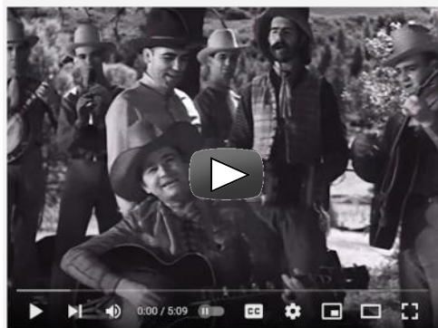
Tex Ritter, Bob Wills, & Jimmie Davis, You Are My Sunshine 1940

I've owned the film, Take Me Back to Oklahoma (below), for over twenty years, but this part was always so dark and fuzzy. I was finally able to make it look good and remove the film noise in the audio.