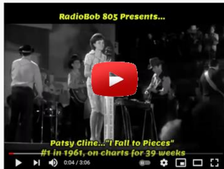
Great STEREO , I Fall to Pieces, Patsy Cline #1 in 1961 - HD video

In 1961 I was a Country DJ on KCKC in San Bernardino. Tenn. Ernie worked there as a DJ long before I did. But I loved this song then, and now in modern stereo, it's even better. This is the original, remastered, and not the overdubbed version. This is her first #1, and it remained on the charts for most of 1961. Walkin' After Midnight was a bigger hit, It only made it #2.