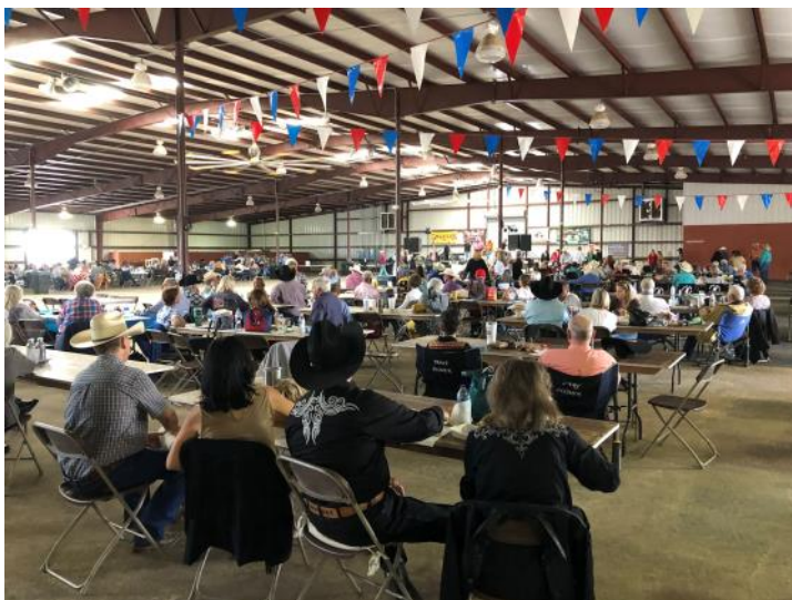
Above: San Angelo Cowboy Gathering venue 2020